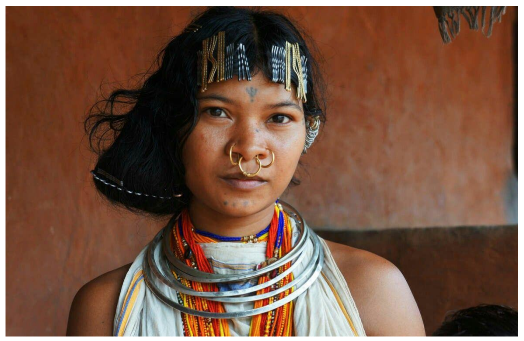
(A tribal woman from the Gondi forests in India. The name of the supercontinent Gondwana follows from these forests. Gondwana supercontinent is believed to have existed about 140 million years ago, and terrestrial Africa and India are believed to have emerged from it)

As India disjointed from Africa millennia ago, it carried with it the fragments of Africa as it may have existed then. These fragments of life and earth from Africa still exists in India, and one may notice it in many ways. The foremost among these being of 'peaceful coexistence among diverse and many'. The people, both in Africa and India, are marked by having lived with their multiple traditions and beliefs since ages. This cultural and traditional diversity is always thought by us as an asset rather than a liability. Good number of studies now support that conflict resolution among communities is at its best when these are intrinsically diverse. Such societies are characterized by strong family and social commitments, and respect for elders. The ageless coexistence of various communities has been possible in Africa and India because of recognition of this wisdom of perceiving the underneath oneness in diversity. In Africa, we see it in her native philosophy, Ubuntu, "I am because we are". It advocates dependency of individual life over collective life. In India we philosophize it as "Vasudhaiva Kutumbakam" which means, 'World is one family'. We again see the reflection of this philosophy of coexistence in the favorite motto of our Prime Minister, 'Sabka Saath Sabka Vikas" meaning 'With collective efforts, everyone flourishes'.